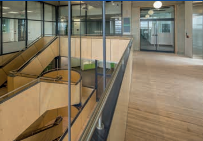
Pictured: Feature stairs at Guys Hospital, London

PAD produce a wide range of general metalwork elements that are commonly required for back-of-house or industrial locations which typically include; open steel floors, fire escapes, factory access stairs, gates, barriers, security screens and many other bespoke elements such as bin stores, railings, guardrails, balustrades and handrails.