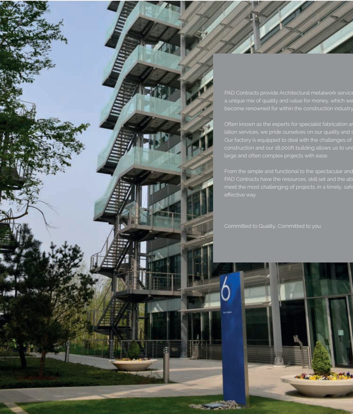
Pictured: Exterior staircase and balustrades at Chiswick Park Building B6, London

We are proud to be accredited with the Achilles Building Confidence Accreditation Scheme to Level 5, and CE Mark to Execution Class 3, demonstrating our industry-leading skills and commitment to quality management.