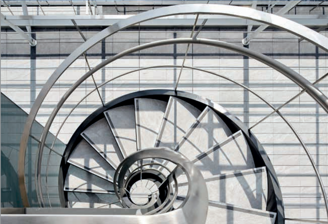
Pictured: Architectural metalworks and staircase at Mark Lane, London

We are proud of our specialist architectural metalwork services and can help your project with elegant staircases, balustrades and hand-rails, and general metalwork solutions. Our in-house design facilities and full project management team are able to create the most challenging designs while expertly managing every stage of the project.